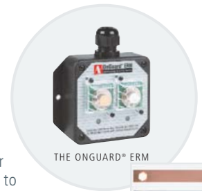
THE ONGUARD® ERM

Purafil, Inc. is a single-source solution for controlling indoor air quality in preservation environments. We offer a comprehensive selection of gas-phase and particulate air filtration systems designed to remove pollutants permanently from indoor, outdoor, and recirculated air. Call Purafil at (770) 662-8545 or (800) 222-6367 for assistance with your air quality concerns.